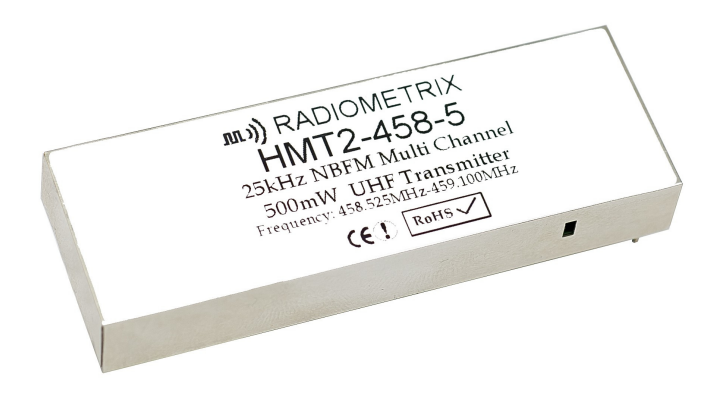
Figure 1: HMT2-458-5

The HMT2 transmitter module offers a 500mW RF output in the UK 458MHz. This unit is ideally suited to applications where existing lower powered transmitters provide insufficient range. The HMT2 transmitter is a multi-channel, narrowband design, suitable for licensed and unlicensed UHF allocations. Together with a matching LMR2 receiver a one-way radio data link can be achieved over a distance of well over 5km (with a suitable antenna).