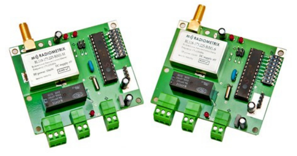
Figure 1: BL118 application boards

These simple application boards use firmware based on the BD118 remote control systems to implement a bidirectional control link. A system consists of a master board (which initiates communication burst cycles) and a slave (which responds to them). In hardware terms these boards are the same, but have different firmware loaded.