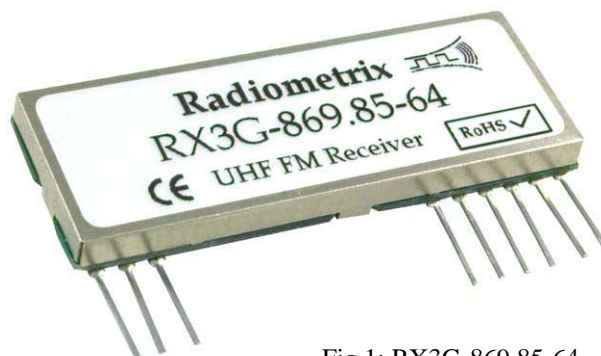
Fig 1: RX3G-869.85-64

With the matching TX3B-869-64 transmitters, RX3G allows the simple implementation of wireless data links at speeds up to 64kbps and distances up to 75 metres in-building or 300 metres over open ground.