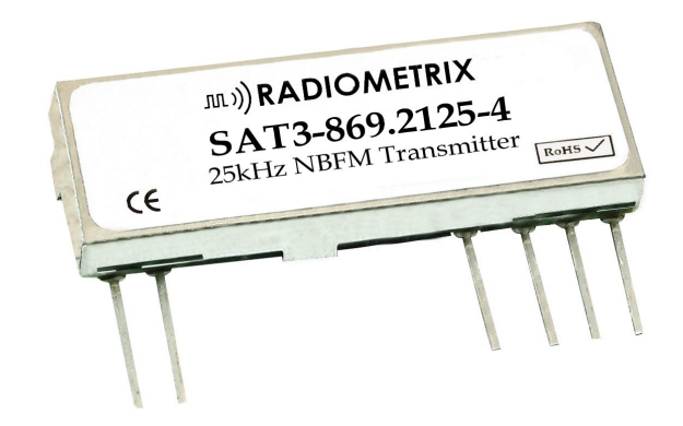
Figure 1: SAT3 transmitter

The SAT3 transmitter modules offer a 10mW RF output UHF data link in Radiometrix SIL standard pin-out and footprint. This makes the SAT3 ideally suited to low power applications using narrow band transmitters. Together with the matching SAR3 receiver a one-way radio data link can be achieved over a distance up to 1km+ with suitable choice of data rate and antennas.