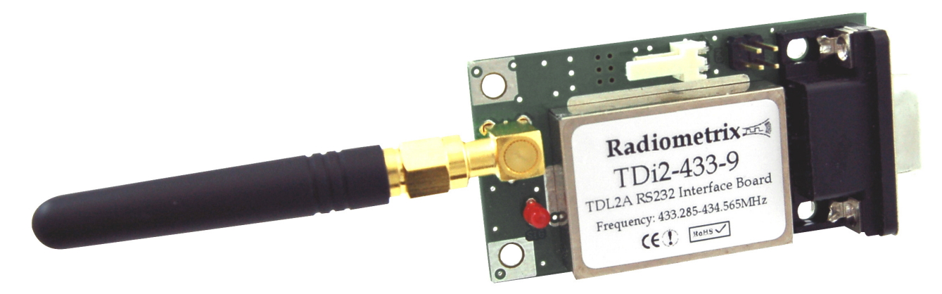
Figure 1: TDi2-433-9

TDi2 interface board enables a cable free transparent data link between RS232 ports without any additional interface circuitry.