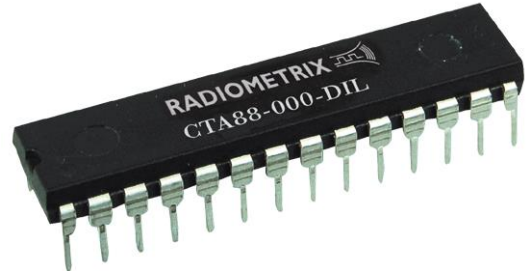
Figure 1: CTA88 in 28 pin DIL package

CTA88 uses 1kbps differential Manchester bit balancing with preamble and checksum. It permits a simple, one way link to be established, for simple remote control applications, with a minimum of effort and no customer software input. CTA88 is available in 28pin SO and DIL packages.